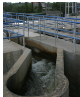
Figure 1 – How to insert a figure

If the picture is not yours, acknowledge the intellectual property of it.